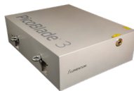
PicoBlade® 3 High-Power Picosecond Micromachining Laser