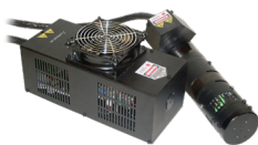
Argon-Ion, Helium-Neon Low-Power Visible CW Lasers