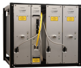
CORELIGHT Fiber Laser Engines