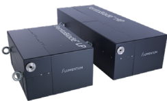
FemtoBlade™ Femtosecond Micromachining Laser