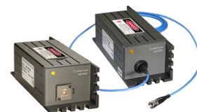
NPRO Visible and IR