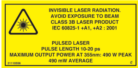
Xcyte Class IIIb

Xcyte 20/60/100 mW lasers are Class IIIb lasers as defined by the Federal Register 21 CFR 1040.10 Laser Safety Standard. The Standard requires that certain performance features and laser safety labels be provided on the product. EMC Declaration of Conformity. UL Mark.