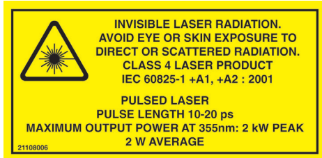
Xcyte Class IV

Xcyte 150mW lasers are Class IV lasers as defined by the Federal Register 21 CFR 1040.10 Laser Safety Standard. The Standard requires that certain performance features and laser safety labels be provided on the product. EMC Declaration of Conformity. UL Mark.